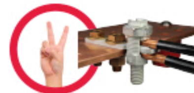
TWO WIRES TO BUSBAR