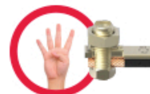
SERVIT POST - WIRE TO STEEL