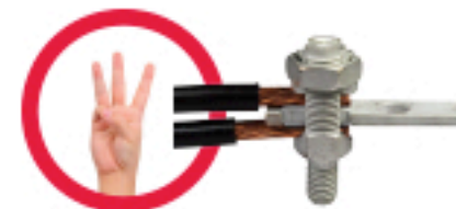
TERMINATE TWO WIRES