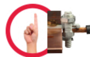
ONE WIRE TO BUSBAR