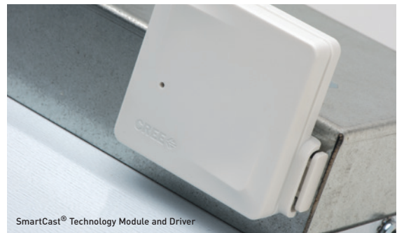
SmartCast® Technology Module and Driver