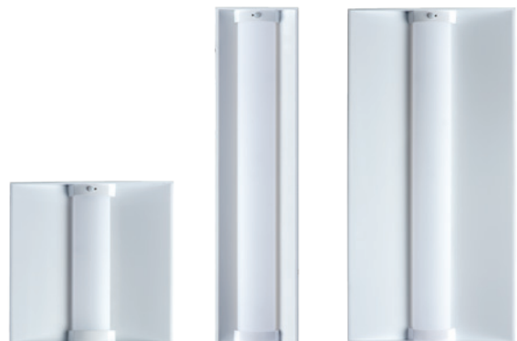
ZR22™ - 2' x 2' LED Troffer